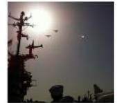
Training Ship Kearsarge